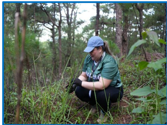
The PCEO and VPCOO joining the Participants of the Tree Planting Activity held in celebration of the 2024 Arbor Day on 21 June 2024 at the VOA, Camp John Hay, Baguio City.