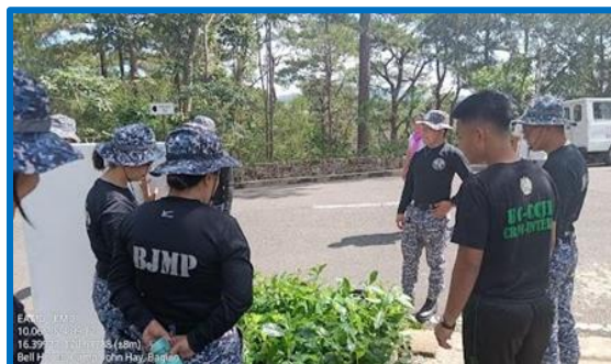
Tree Planting by the BJMP.