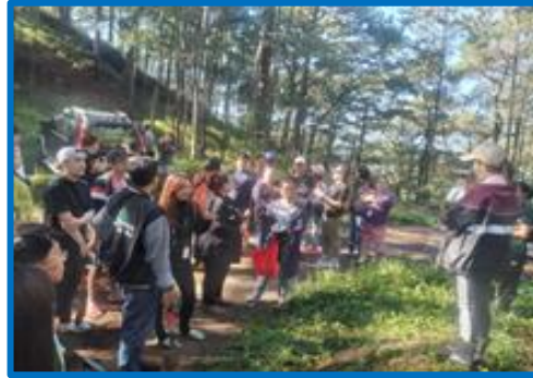
Tree planting by Concentrix.