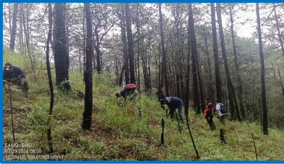
Tree planting of Deltans.