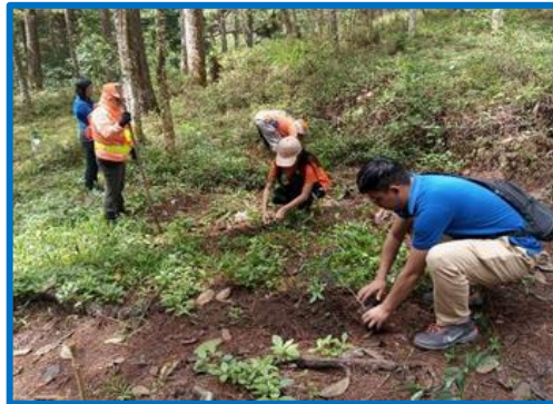
Tree planting with the DPWH, BCDEO.